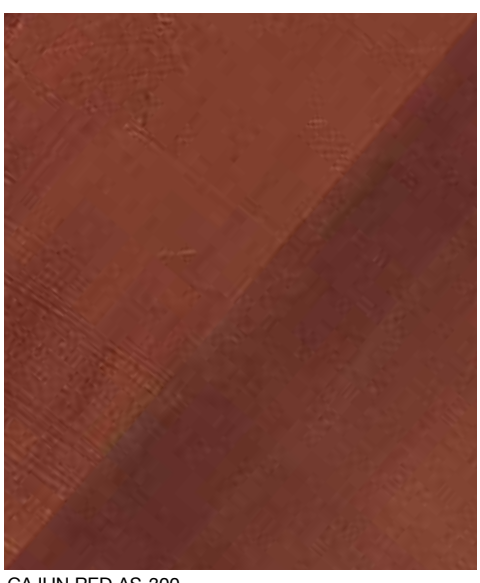
CAJUN RED AS-300